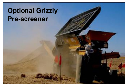
Optional Grizzly Pre-screener