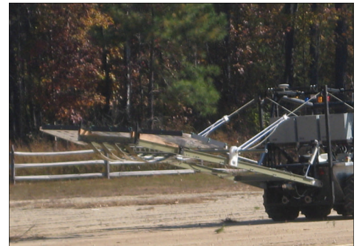
Ebinger UPEX 740 Deep Search Sensor Array