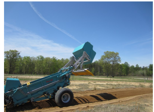
(left) Bed style system in Sri Lanka, (right) rear-mounted receptacle depositing sifted material for inspection