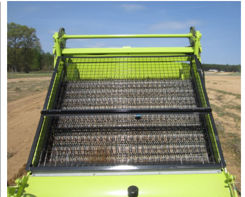
(left) Illustration of sifting mechanism, (right) mine simulant being lifted by the Turf Rake during technical evaluation